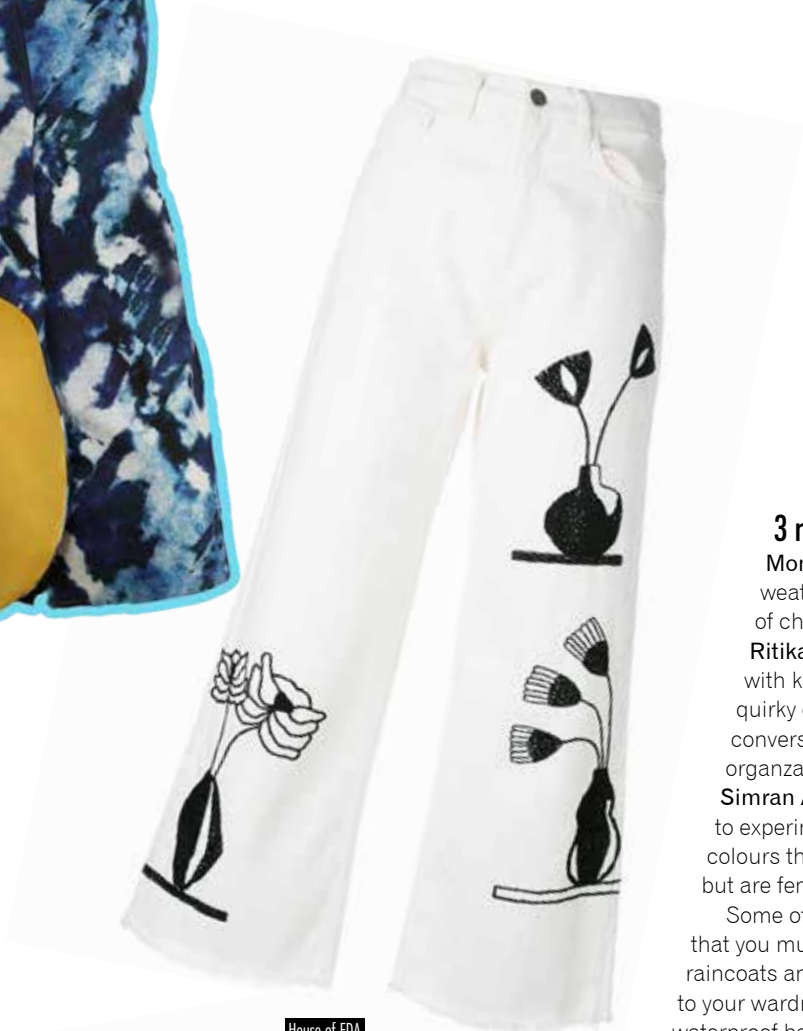
House of EDA