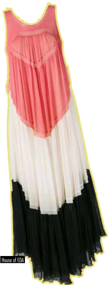
House of EDA